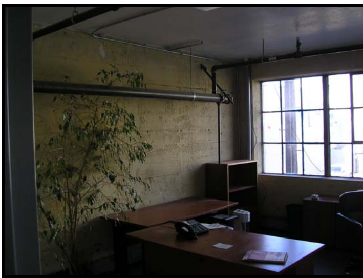
MEZZ OFFICE AREA