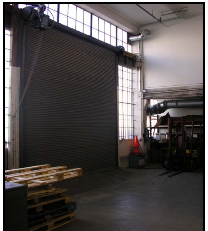
ROLL UP DOOR