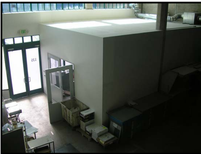
FIRST FLOOR CLEAN ROOM