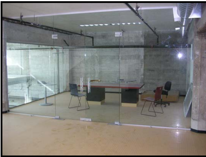
MEZZ OFFICE AREA