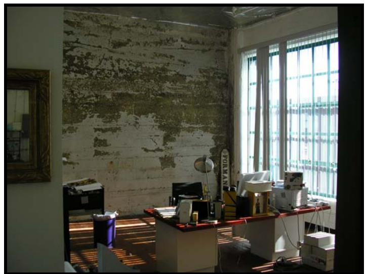
SECOND FLOOR OFFICE